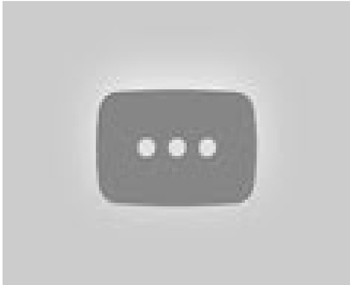
The Pretty Clever Films TIFF13 Coverage is brought to you in part by MUBI, your online cinemetheque.