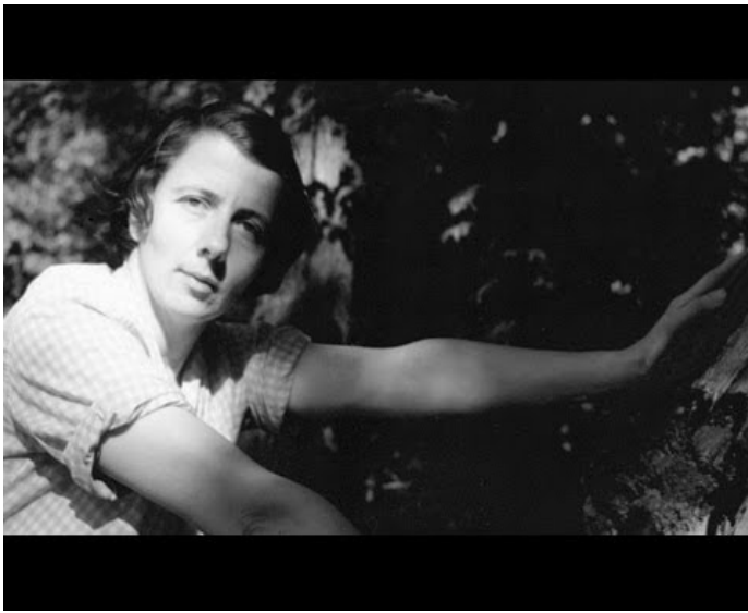
The Pretty Clever Films TIFF13 Coverage is brought to you in part by MUBI, your online cinemetheque.