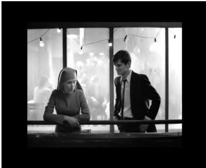
The Pretty Clever Films TIFF13 Coverage is brought to you in part by MUBI, your online cinemetheque.