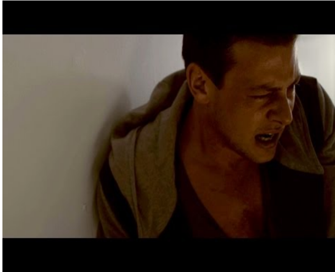
The Pretty Clever Films TIFF13 Coverage is brought to you in part by MUBI, your online cinemetheque.