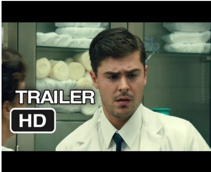
The Pretty Clever Films TIFF13 Coverage is brought to you in part by MUBI, your online cinemetheque.