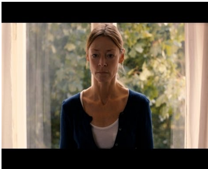
The Pretty Clever Films TIFF13 Coverage is brought to you in part by MUBI, your online cinemetheque.